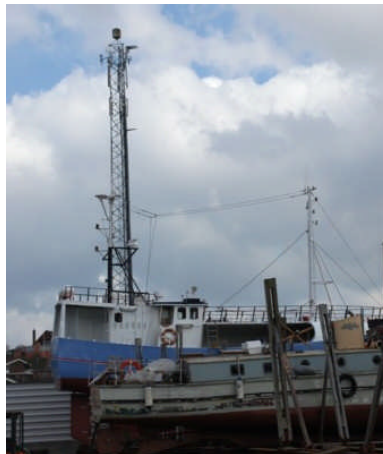
MV FIREWALL