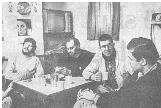
CREW IN MESSROOM MI AMIGO