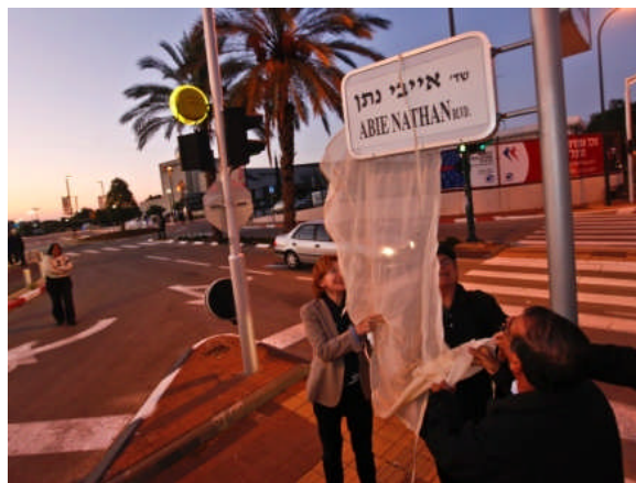
Official opening Abie Nathan Boulevard

And once again a reader made another one happy again! May I recall the entrance is still open to send your personal deejay to 8 to me as I want to make a total list in the future? So make the list and send it to HKnot@home.nl