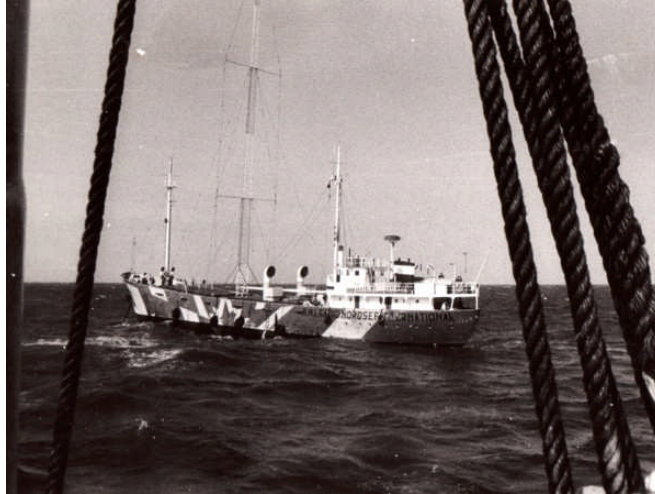
MEBO II seen from the tender